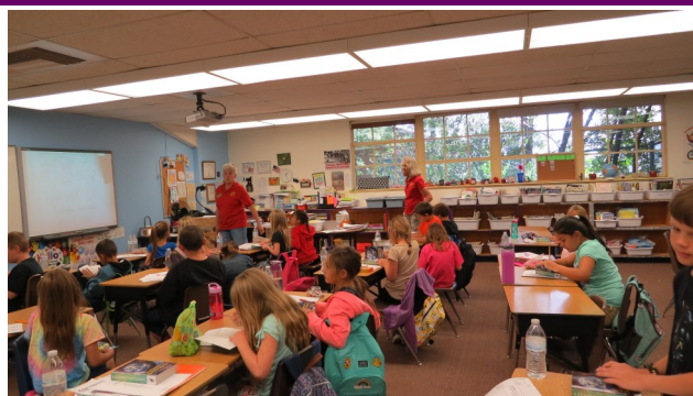
Article and photos submitted by Norman Swanty.