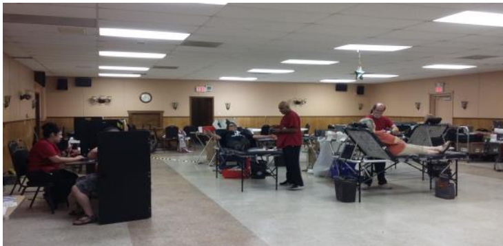
Pictured: Red Cross workers and blood donors