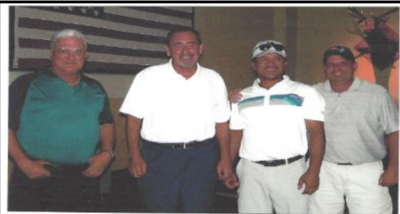
AEMP golf tournament winners: