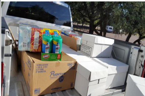
Pictured Left: Supplies for the Wounded Veterans.