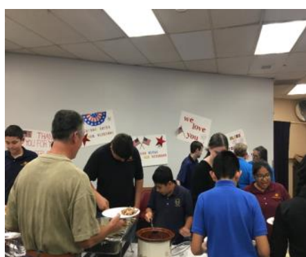
Pictured (1) Lodge room setup prior to our guests' arrival. (2) Our guests are seated just prior to the Veterans Day Service. (3) Salpointe students serve up dinner