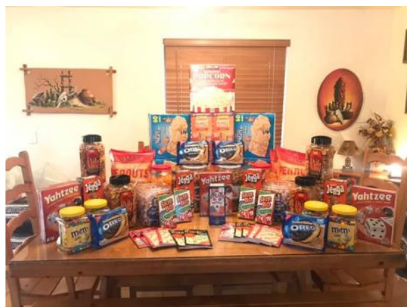
Some of the goodies to be delivered to our First Responders as Care Packages.