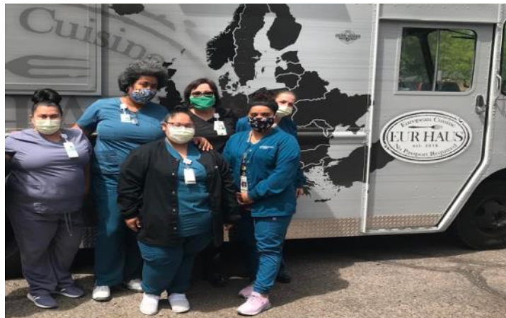
Picture in front of food truck attached left to right healthcare workers of Banner Desert hospital