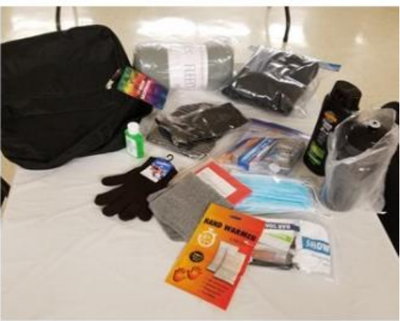
Each backpack has a blanket, gloves, socks, washcloth, under wear and t-shirts, a water bottle, masks, hand sanitizer, and a myriad of personal hygiene products.