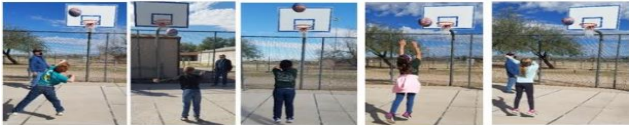
24 students and 11 lodge members participated in the event at a local charter school.