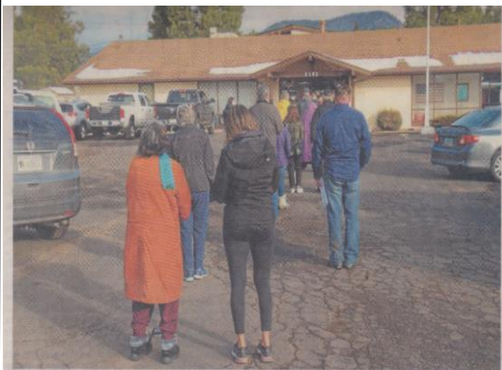
People wait in a line that stretched out into the parking lot at the Elks Lodge Wednesday morning at a newly opened COVID-19 vaccination site run by Flagstaff Medical Center.