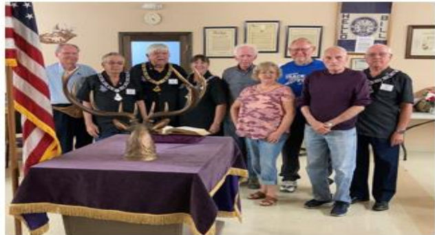
Veterans in attendance gather before the altar to be recognized