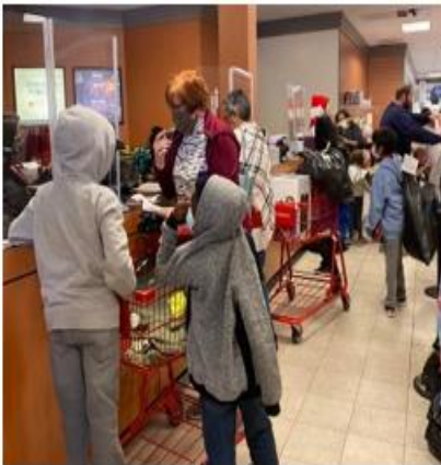
Children with their adult shopper checking out