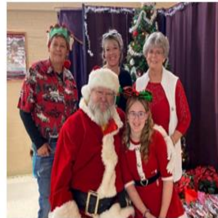
Santa with some of his helpers