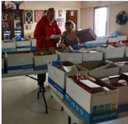
Filling the boxes