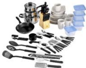
Contents of Kitchen in a box