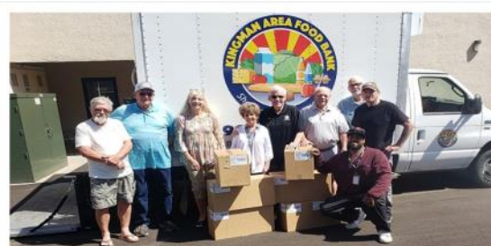
Kingman Elks Lodge recently donated 450 pounds of individually packaged macaroni and cheese meals to the Kingman Area Food Bank.

Originally Published: April 9, 2022 6:06 p.m. Updated as of Saturday, April 9, 2022 7:35 PM