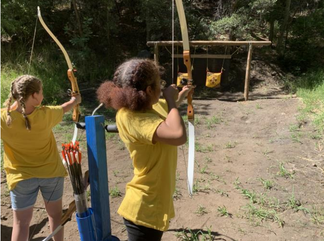
Campers enjoying both of the newest camp activities