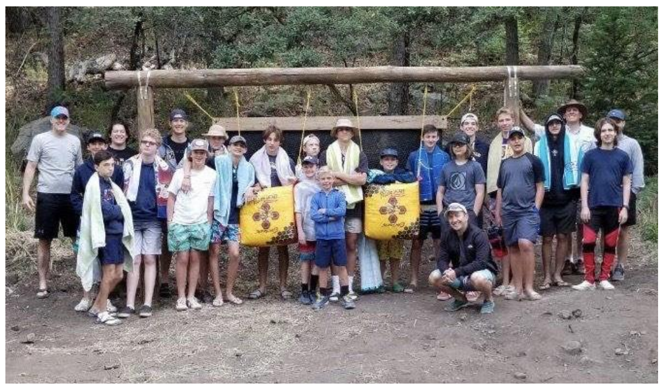
The Tempe Foothills Ward Young Men's Group that built the archery range