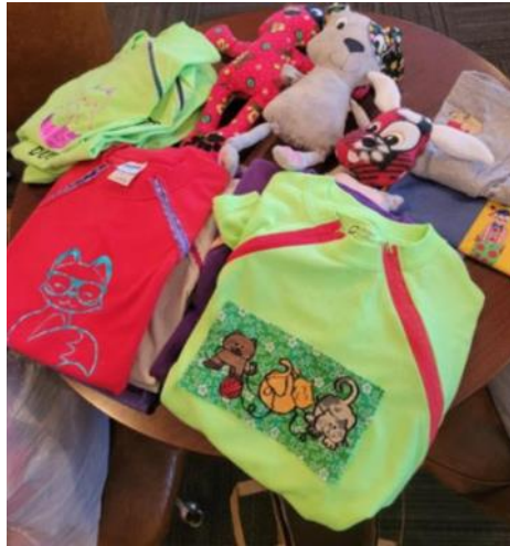
Zipper t-shirts that kids do not have to take their shirts off when getting treatment.