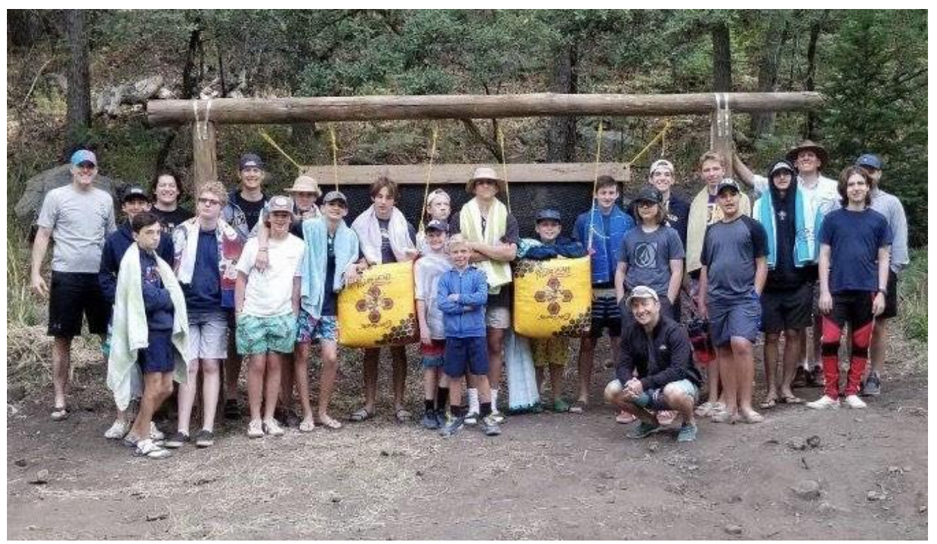
The Tempe Foothills Ward Young Men's Group that built the archery range