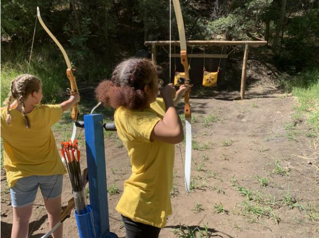
Campers enjoying both of the newest camp activities