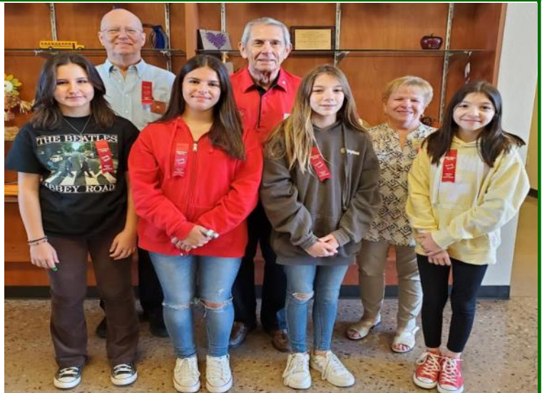
Left to Right – Front Row Escorts:

Anza Trail School (Sahuarita, AZ) – 1,100 Red Ribbons and 200 Coloring Books