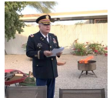
Following the Service, service-worn flags were 'retired' in the proper, dignified manner. PER Bruce read the flag retirement order of precedence prior to the officers adding the flags to the fire.