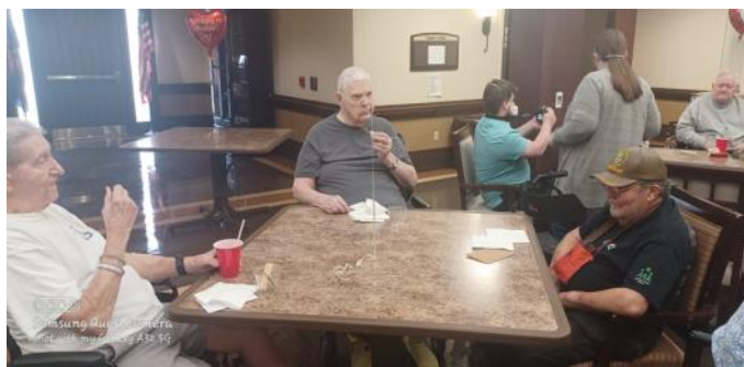
Some residents of the Home waiting on their orders