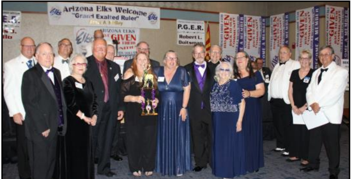
Phoenix Lodge #335—Arizona State Ritual Champions