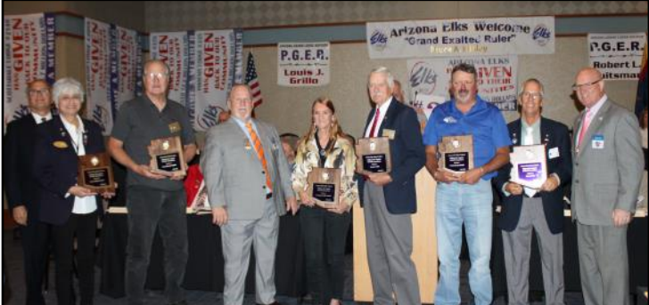
Top ENF Per Capita Winners