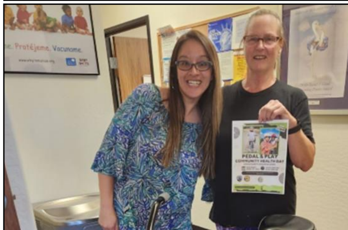
Payson Lodge #2154 donated two bicycles to the Pedal & Play Community Health Day, a biking safety education event, held on April 27th.