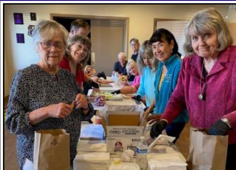
Members and volunteers making sandwiches.

The Tucson AZ Elks Lodge #385 made about 470 sandwiches for the Special Olympics Event held at the Tucson Amphi High School on April 13, 2025. Many Elks members(18) and volunteers (6) helped with the making of the sandwiches and the distribution at the event itself. Over 400 athletes and about 50 other volunteers at the event.