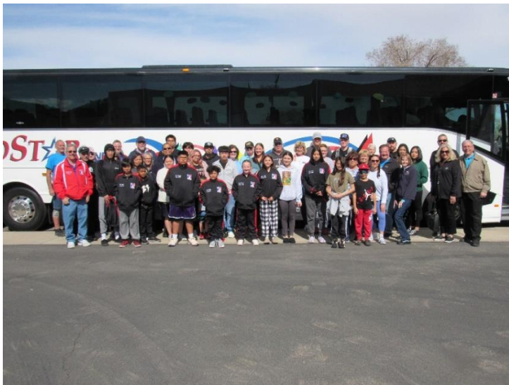
The infamous "Junk Food Express" featuring the Arizona Representatives at the Regional Competition in Las Vegas.